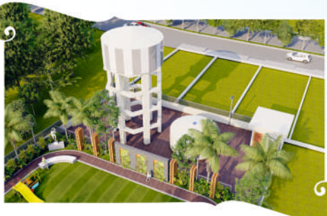
Overhead Water Tank