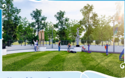
Yoga / Open Gym