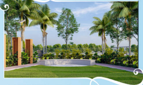
Senior Citizen Area