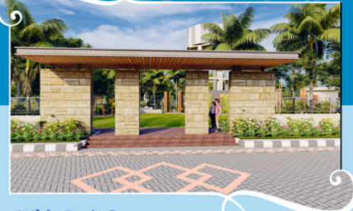
Wide Park Gate