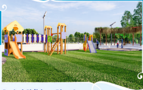
Park / Children Play Area