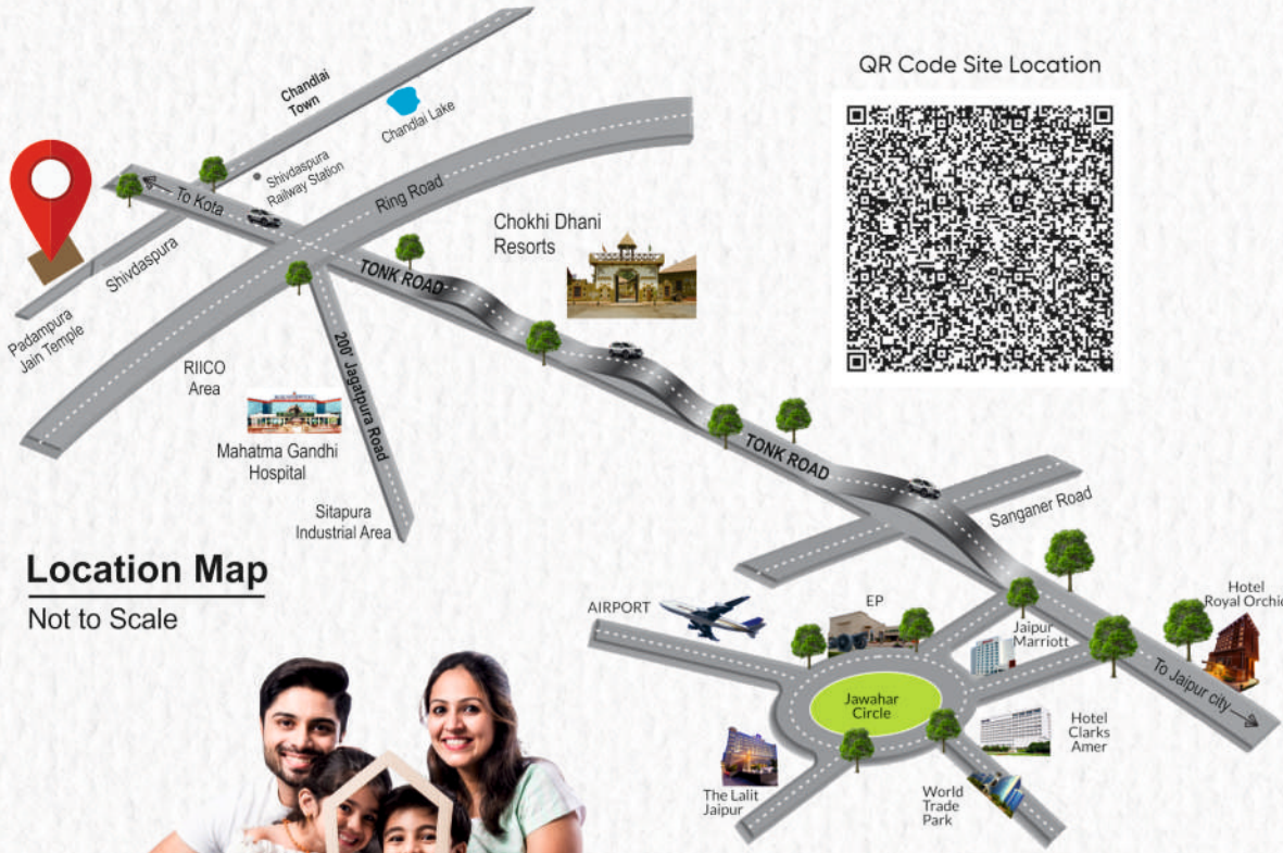
Location Map Not to Scale