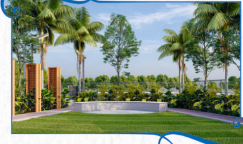
Senior Citizen Area