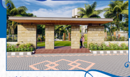
Wide Park Gate