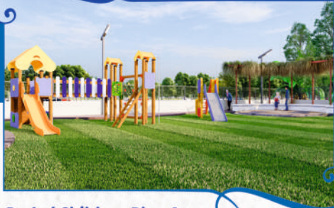
Park / Children Play Area