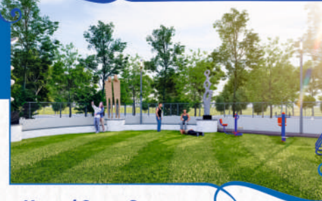
Yoga / Open Gym