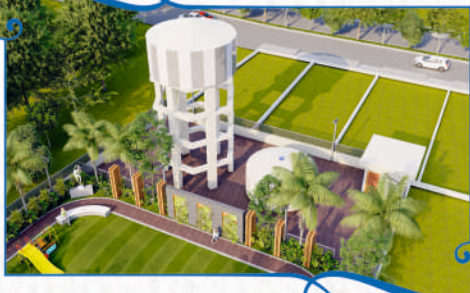
Overhead Water Tank